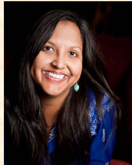
With Keynote Speaker

The Wyoming Writers Conference Committee in Gillette, Wyoming welcomes all to the 2017 Wyoming Writers, Inc. Conference in the Multi-Event Facilities of the Energy Hall of the CAM-PLEX. The flexibility of this facility allows for the clustering of eight break-out spaces which will help conference participants to move easily from one function to another, to take coffee breaks, to get together to visit, or enjoy the great meals the caterers are planning. Supported by the CAM-PLEX's excellent staff, and with accommodations at the Arbuckle Lodge (voted the best in Gillette) just across the street, the 2017 Wyoming Writers, Inc. Conference promises to be exciting, memorable and fulfilling!